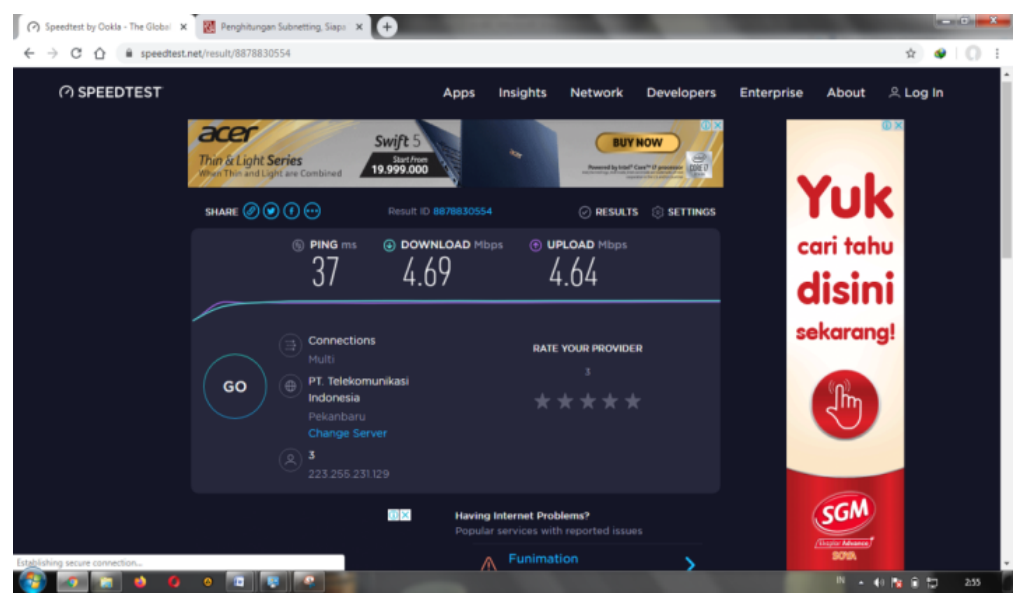
Figure 2. measure network speed ie index ping, download, upload